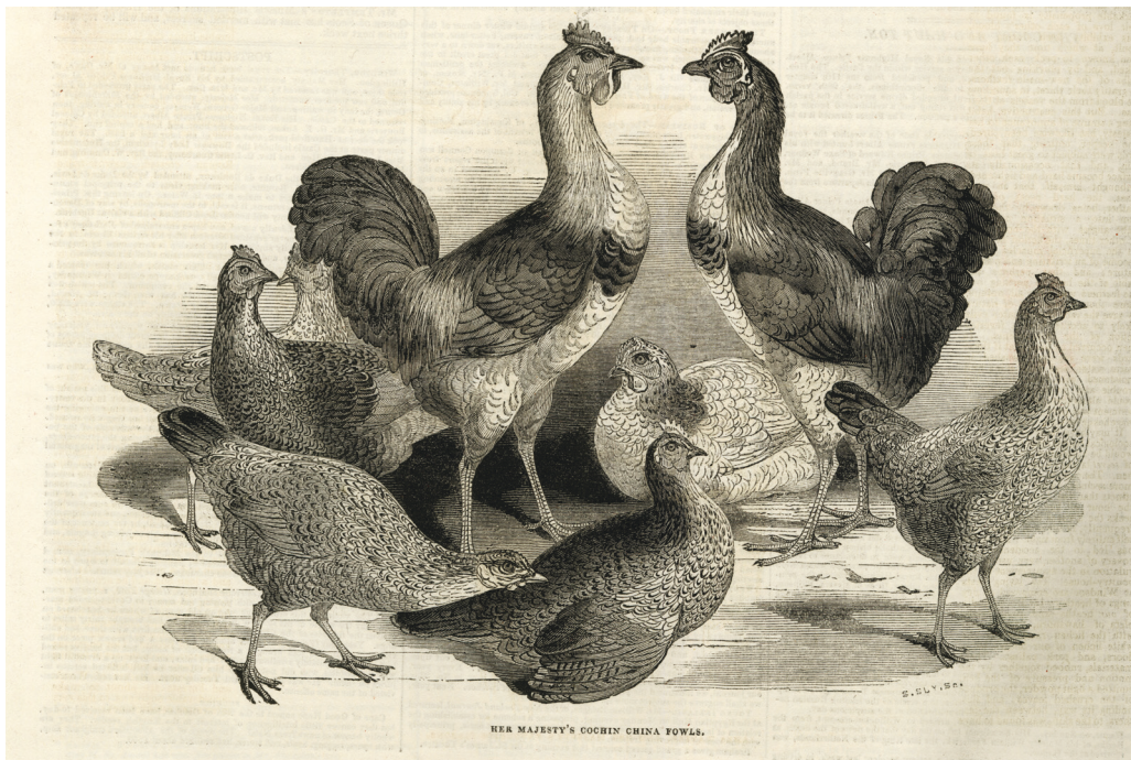
Figure 5. Engraving of the Cochin China Fowl kept by Queen Victoria at Windsor, by Samuel Read (1816–83), published on 23 December 1843 in The Illustrated London News