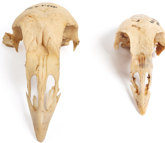
Figure 9. Dorsal view of a Cochin skull NHMUK 1868.2.19.70, left, showing a deep groove along the middle of the frontal bone, compared with Red Junglefowl G. gallus skull NHMUK 1868.2.19.59, right, showing the flat surface to the frontal bone