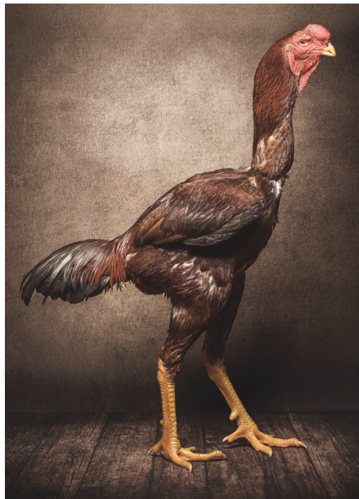
Figure 4. Black-breasted Red Malay cock, one of the tallest breeds of chicken, originally bred for cockfighting but nowadays for exhibition alone

the same as Temminck's G. giganteus . The birds pictured resemble the Aseel, an Indian breed used for cockfighting (see Appendix 2).