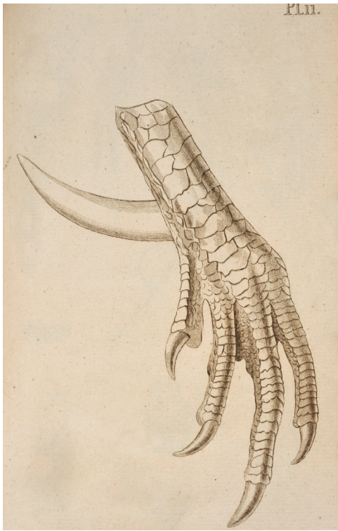
Figure 1. Pl. 2 in Temminck 1813, depicting the foot of Gallus giganteus