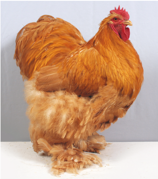
Figure 7. Buff Cochin cock; the Cochin, first introduced into Britain in 1847, does not originate from Cochinchina (Vietnam) but from China and is kept purely for exhibition. The Cochin is in many aspects very different from other breeds but, according to Darwin (1868: 260), ‘All the characteristic differences of the Cochin breed are more or less variable and may be detected in greater or lesser degree in other [Chinese] breeds’