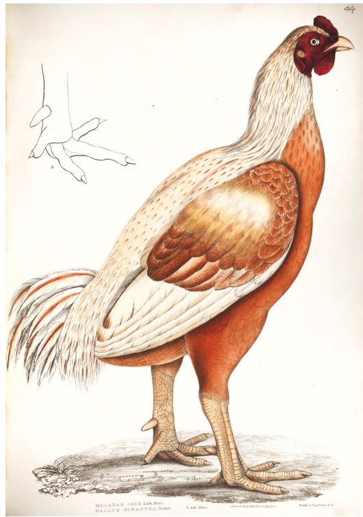
Figure 2. Pl. 44, Malabar cock Gallus giganteus , by Benjamin Waterhouse Hawkins in Gray & Hardwicke's Illustrations of Indian zoology

Marsden (1754–1836) had used the name ‘Jago’—from the Sumatran or Malay ‘Jago’ for a breed of chicken used for cockfighting (Dixon 1848: 176)—writing ‘The jago breed of fowls, which abound in the southern end of Sumatra, and western of Java, are remarkably large: I have seen a cock peck off of a common dining table: when fatigued, they sit down on the first joint of the leg, and are then taller than the common fowls’ [this typical resting position is displayed by many large, long-legged, fighting breeds] (Marsden 1783: 98).