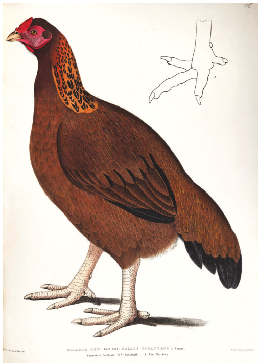
Figure 3. Pl. 45, Malabar hen Gallus giganteus , by Benjamin Waterhouse Hawkins in Gray & Hardwicke's Illustrations of Indian zoology