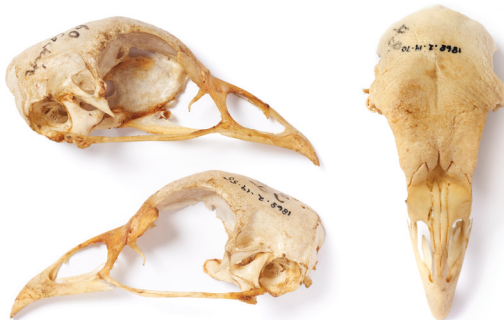
Figure 8A–B. Two Cochin skulls from Darwin’s collection, right a male, NHMUK 1868.2.19.70 (Darwin’s no. 48) and left a hen, NHMUK 1868.2.19.55 (Darwin’s no. 60). Sectioning of the hen’s skull was performed by (or for) Darwin, as it was needed for a picture on p. 263 in Variation under domestication, 1868, vol. 1 (see Fig. 8B), wherein it is stated that the skull is of a male